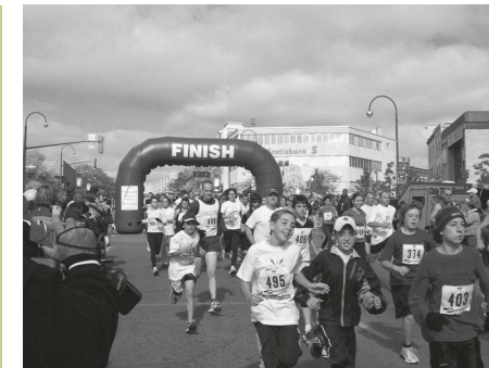
Participants crossing the finish line at the Thanksgiving Day Races where proceeds go to the Guelph Mercury Kids-to-Camp Fund.

The GCF volunteers bring a wealth of talent and expertise to our work. Through their guidance and vision, we have made wonderful progress.