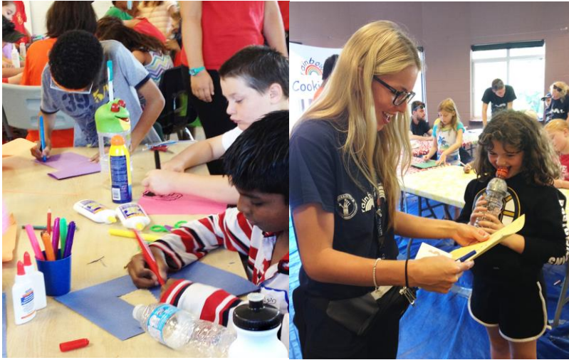
Shown above: Creative Encounters with Science, Guelph Neighbourhood Group Summer Camps, Rainbow Day Camp